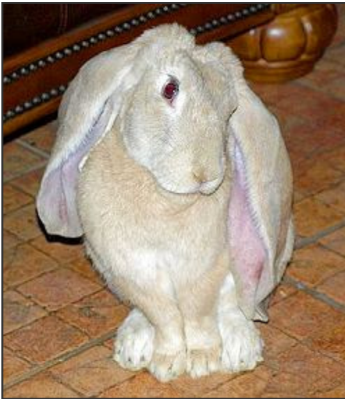
Bunny Model: Baxter

The English Lop is one of the oldest breeds of rabbits. It was the first true fancy breed of domestic rabbit. One lovable characteristic of bunnies is their ears but of course rabbit ears are not the same among the breeds. Lops have ears that flop over and grow long and sometimes their ears slant sideways or over the front of their head. The most recognizable trait of the English Lop is their extremely long ears. Some people refer to English Lops as 'floppy-eared'. Their ears grow to a minimum of 21 inches from top to bottom and can grow to 25 inches or greater, however most stay within 21 to 25 inches. The ears of an English Lop are normally falling on the ground. The ears usually stop growing at about 4 months of age.