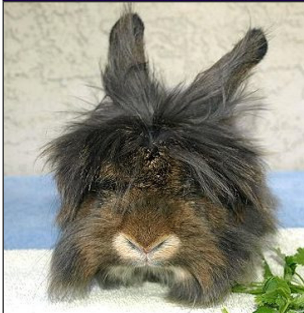
Bunny Model: Jazz

"I don't want to hear about your 'bad hair day.' I have a 'bad hair LIFE!'"